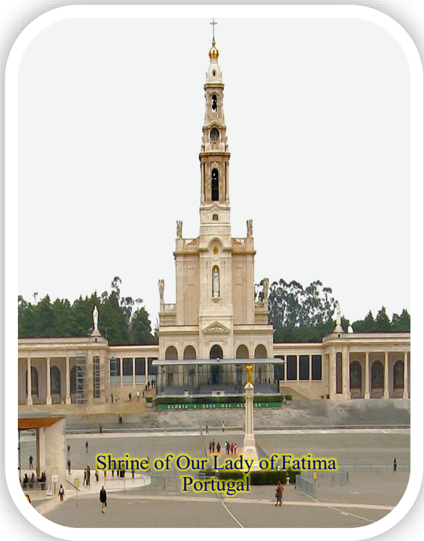
Shrine of Our Lady of Fatima Portugal

Divine Mercy Apostolate PO Box 73 PASCOE VALE STH VIC 3044